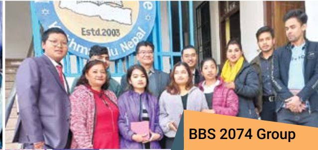
BBS 2074 Group