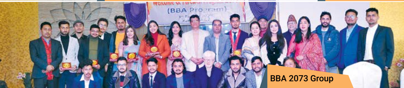
BBA 2073 Group