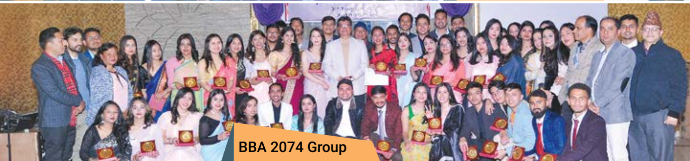
BBA 2074 Group