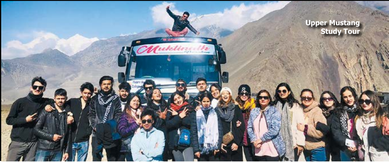
Upper Mustang Study Tour