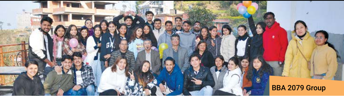
BBA 2079 Group