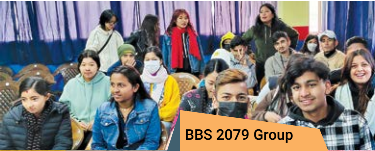
BBS 2079 Group