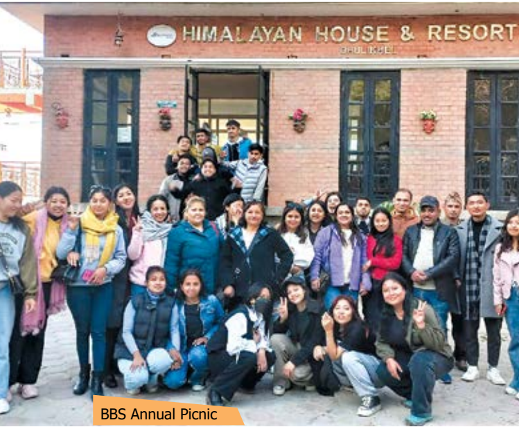
BBS Annual Picnic