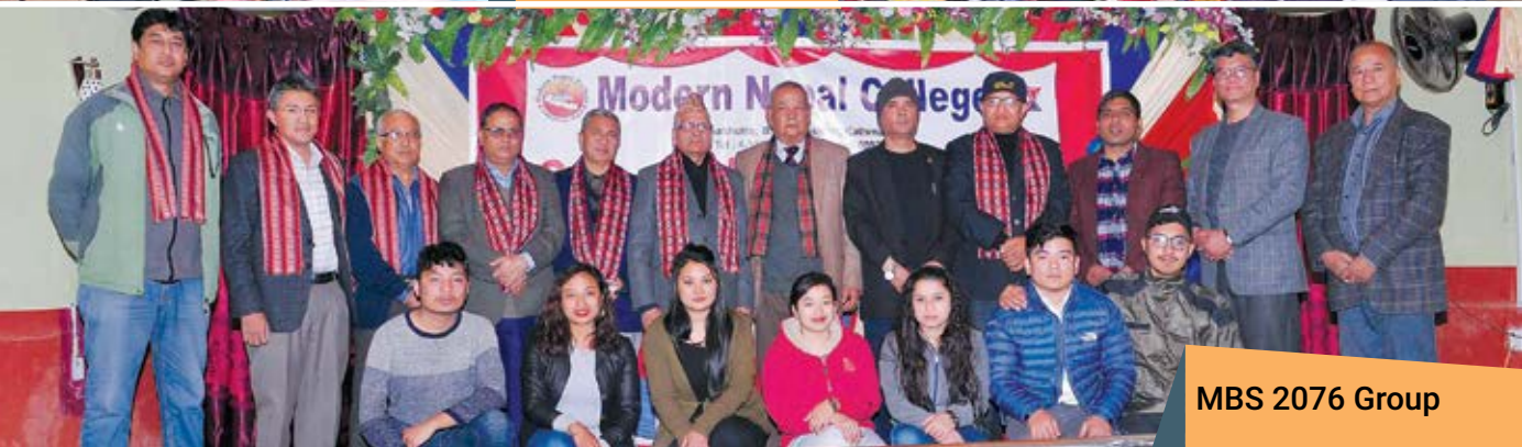
MBS 2076 Group