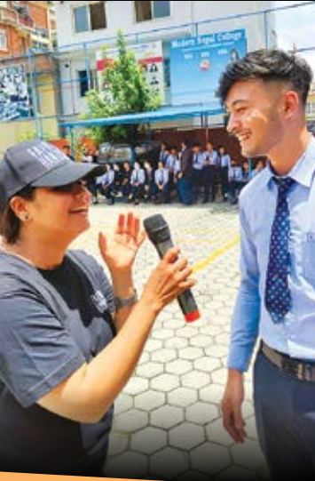
Fair & Handsome Face Hunt Nepal 2023