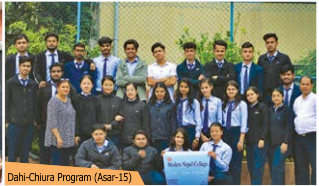
Dahi-Chiura Program (Asar-15)