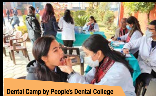
Dental Camp by People's Dental College