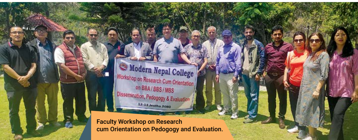
Faculty Workshop on Research cum Orientation on Pedogogy and Evaluation.

MGT 523 Strategic Management Specialization Courses : 3 Subjects MGT 525 : Dissertation